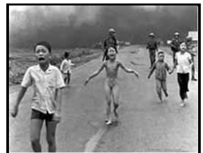
Children fleeing for their lives. This is another captivating image from the war in Vietnam by Eddie Adams.